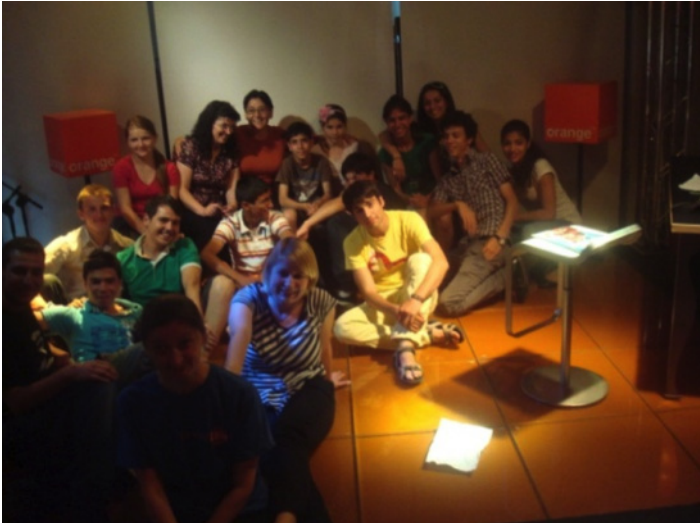
"YOUNG MULTIPLIERS" PROJECT

Partners Foundation for Local Development (FPDL) is a Romanian non-profit organization committed to the enhancement of the democratic processes of governance, supporting local development, strengthening the civil society, and promoting a new culture of change and conflict management. As a part of their "Youth Multipliers" project, promoting youth participation, Partners Foundation for Local Development (FPDL) staged six Forum Theater plays in Bucharest together with young volunteers (18-25 years old). The project promoted the principle of youth participation through volunteerism and was supported by the European Commission's Youth in Action Program. The use of Forum Theater increased awareness of the importance of volunteering and its impact on personal and community development. 500 young people, public authorities, and NGO sector members participated.