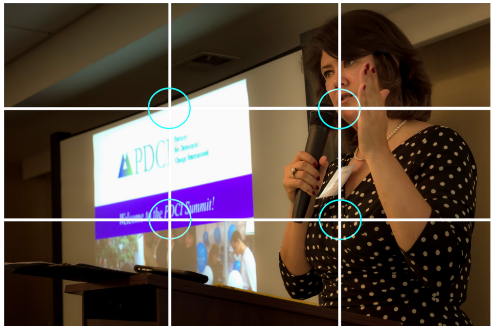
TOP: RULE OF THIRDS GRID