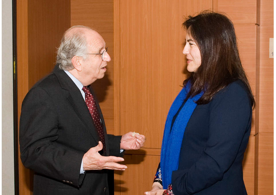
DIÁLOGO Y GOBERNABILIDAD, JUNE 2014

Why did you (decide to take that action)?