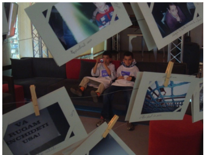
PARTNERS FOUNDATION FOR LOCAL DEVELOPMENT, THE ROMANIAN ORGANIZATION AFFILIATED WITH PARTNERS, USED PHOTO VOICE WITH YOUNG PEOPLE TO DOCUMENT THE DISCRIMINATION THEY FACE EVERY DAY.